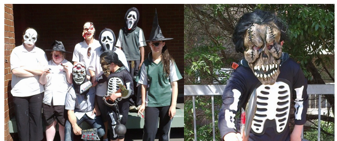
MCC Class of Horrors

The MCC class got into the 'spirit' of Halloween this year. Several classrooms and the main office were raided by ghouls, witches and some rather ugly characters.