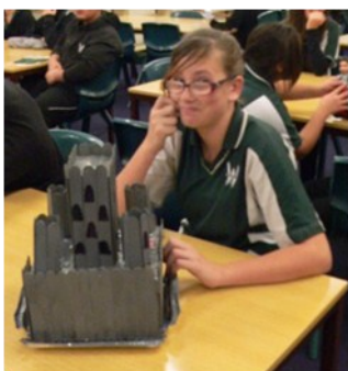
Trinity Lewis Medieval Castle