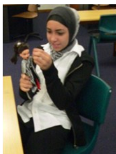
Meleke Erkilic Medieval Doll