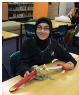
Layla Ugur Medieval Sword