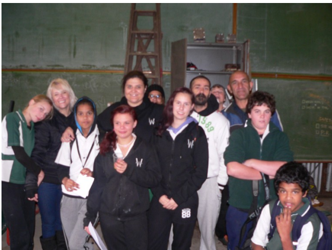
Koori Kids, friends and support staff