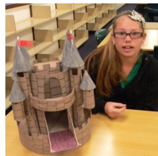
Dakota Nolan Medieval Castle