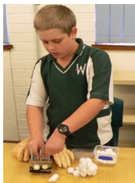
Dylan Pitt Thumbscrews