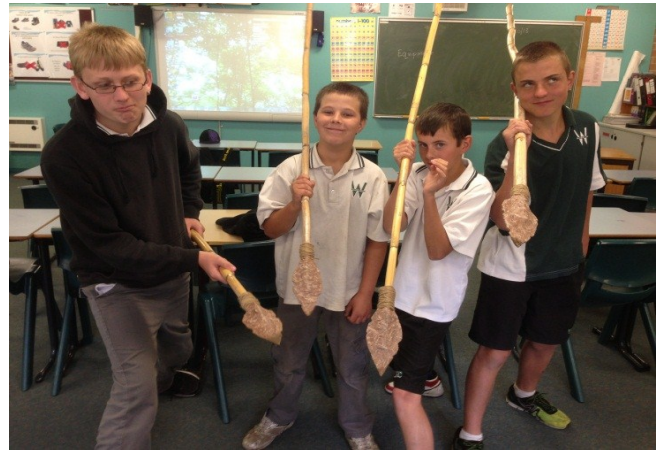
Support Juniors showing their spears