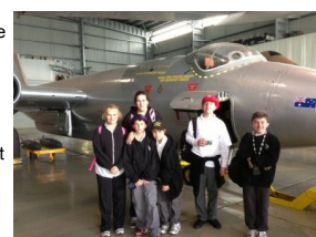
Support Students next to a 1950's Canberra bomber