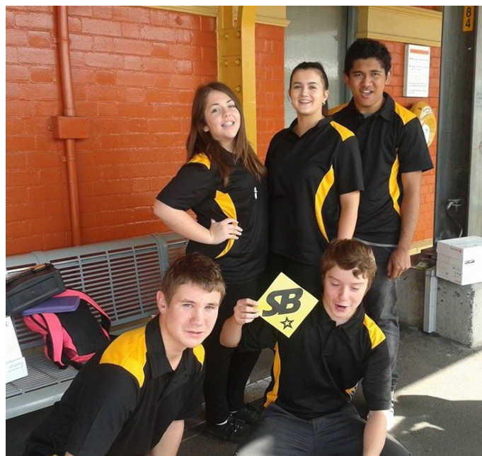
Sonic Boom Racing Team