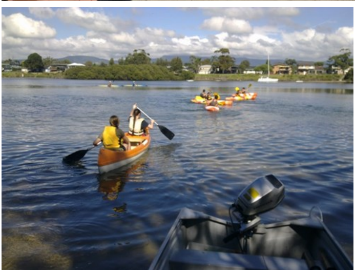
A great stay was had by all along with some learning that will be important in the Higher School Certificate